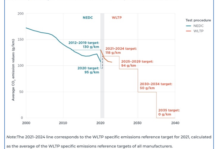
Figure 1. Historical average NEDC and WLTP CO 2 emission values and targets for new passenger cars without flexible compliance mechanisms

ICCT says the pace of CO 2 emission reductions has varied over the years, with reduction rates generally accelerating as deadlines approach. Between 2000 and 2007, before the first standards were agreed in 2008, fleet CO 2 emissions, on average, declined by 1.9 g/km per year. From 2008 to 2015, manufacturers exceeded the annual reduction rates required to meet the 2015 target of 130 g/km. Rather than the required 3.6 g/km annual reduction, average CO 2 emissions dropped by 4.9 g/km per year. All manufacturers met their target in 2015. From 2015 to 2019, with no stricter targets in place before 2020, average CO 2 emissions increased by 0.7 g/km per year. As the next target approached, a significant turnaround occurred from 2019 to 2020, when emissions dropped by an average of 14 g/km. All manufacturers met the 2020 target of 95 g/km using flexible compliance mechanisms.